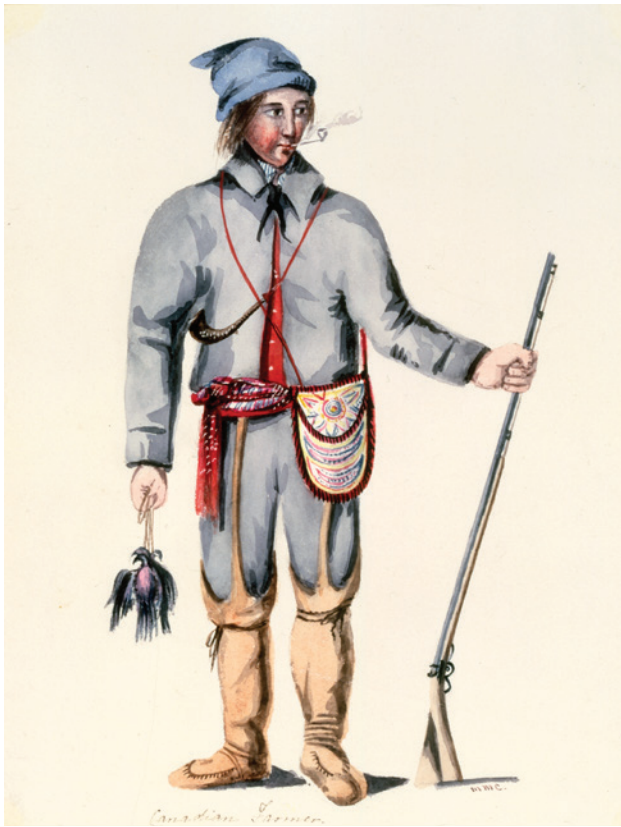
Library and Archives Canada

2. Canadian Farmer by Mary Chaplin, 19th century: woven arrowed sash ( ceinture fléchée ), leather bag decorated in the Indigenous style, and high leather boots ( bottes sauvages ).