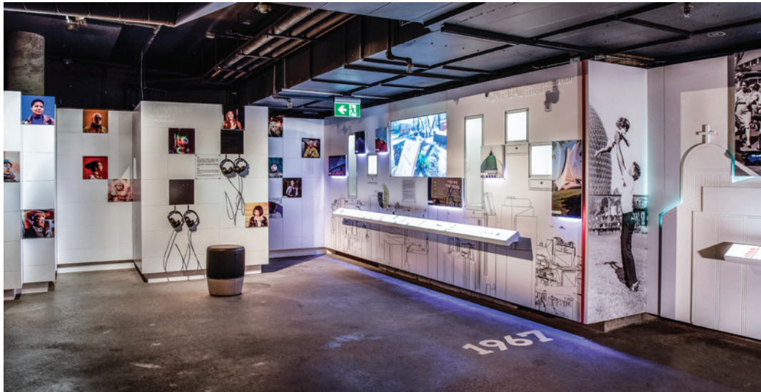
An immersive, luminous, chronological timeline.